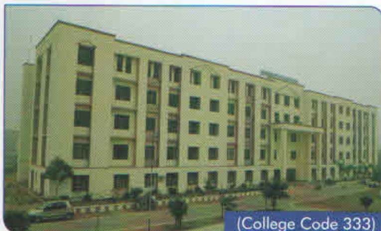
(College Code 333)

(Approved by AICTE, New Delhi & Affiliated to Dr. A.P.J Abdul Kalam Technical University, Lucknow)