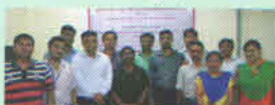
Conducted 5 Days FDP on "Electrical Power System"