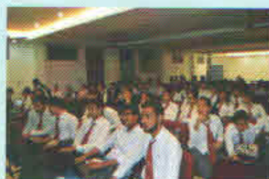
One Day workshop on Digital Marketing