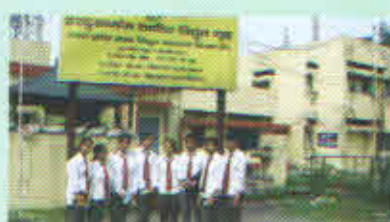
Industrial Visit at "Harduaganj Power Station"

I welcome all the students & their parents to the Department of Electrical & Electrical Engineering. Electrical & Electrical Engineering is an essence of today's world. We are committed to providing not only the technical education to our students but also the leadership qualities through which they can create employment to others. The EN Department focuses on holistic development of the students by a combination of both curricular and extracurricular activities.