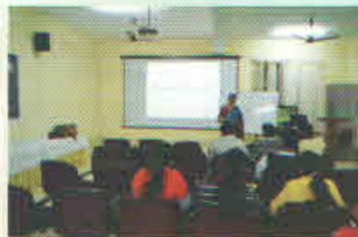
One week FDP on Computational Complexity.