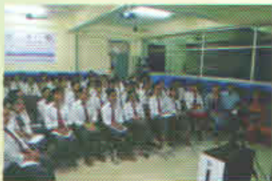
One day workshop by IIT Bombay on College to Corporate Program.