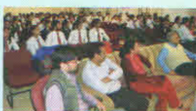
Conducted workshop on Designing of Micro strip patch antenna

The Department of Electronics & Comm. Engg. Comprises all the latest & modern facilities. The department is equipped with all the labs as per the curriculum. The various labs being the CAD lab, Advance Electronic lab, Integrated circuit lab (with latest Texas instrument kit), Antenna and Microwave Lab, Communication Lab etc.