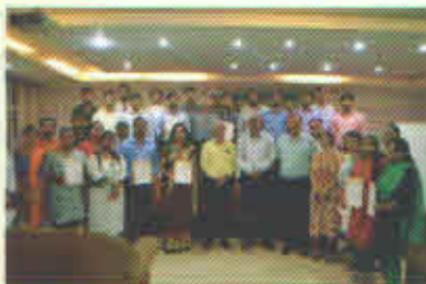
One day FDP by IIT Bombay on SCILAB.