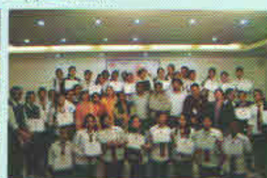
One Day Workshop on MATLAB Application