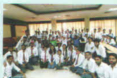
Industrial Visit at BSNL AIT Centre Ghaziabad