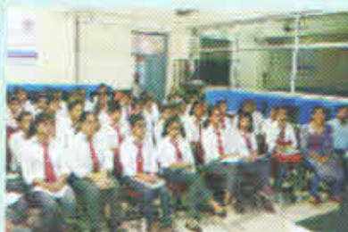
One day workshop on "c and C++"