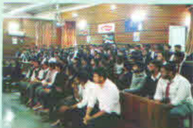
Industrial Visit at Parle Bahadurgarh.